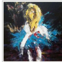
"All that Glitters"