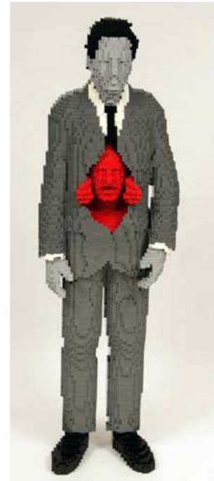
"The Courage Within"

Tags: Video | Get Alerts for these topics »