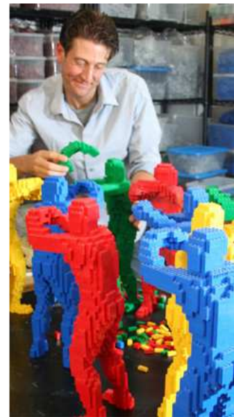
"The Adventures of Hugman"